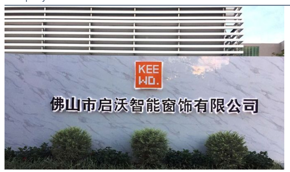
KEEWO, China's curtain decoration accessory exporting enterprise manufacturer. We focus on the development

production and sales of curtain decoration products and providing high quality products, as well as professional services.