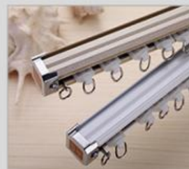
D500 Volos heavy composite rail series