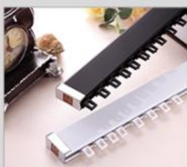
F500 aesthetic electrophoresis flat lower rod