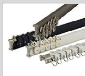
I curved rail series